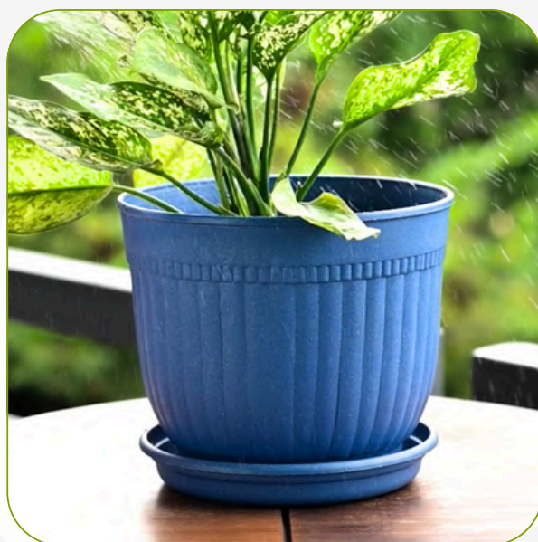
Petal pot with tray