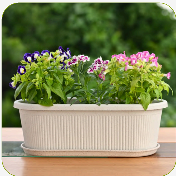
Regalia pot with tray