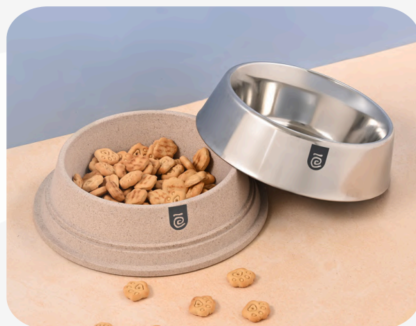
Duo bowl - 2 in 1