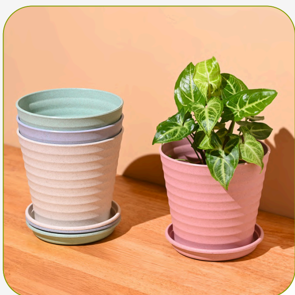
Linea pot with tray