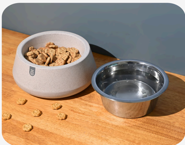
Ecosteel Bowl - 2 in 1