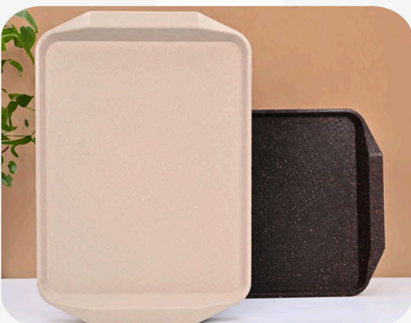
Cafeteria serving tray