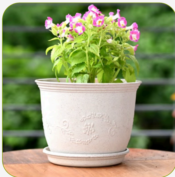
Leafy pot with tray

Colors: tortilla, charcoal & sand castle