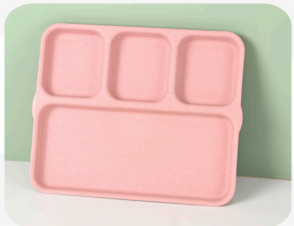
4 Partition plate