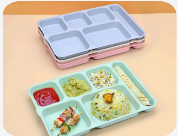
6 partition plate