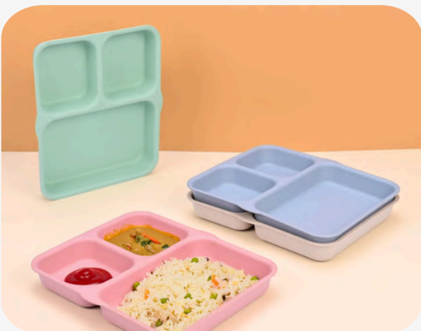
3 partition plate