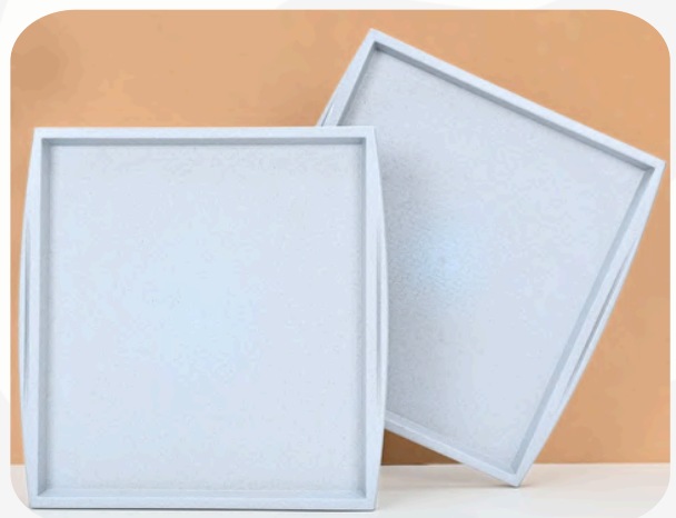
Square serving tray