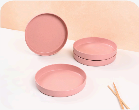
Round snack plate