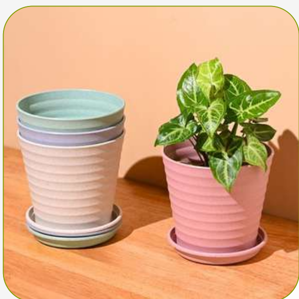
Linea pot with tray