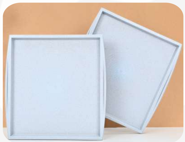
Square serving tray