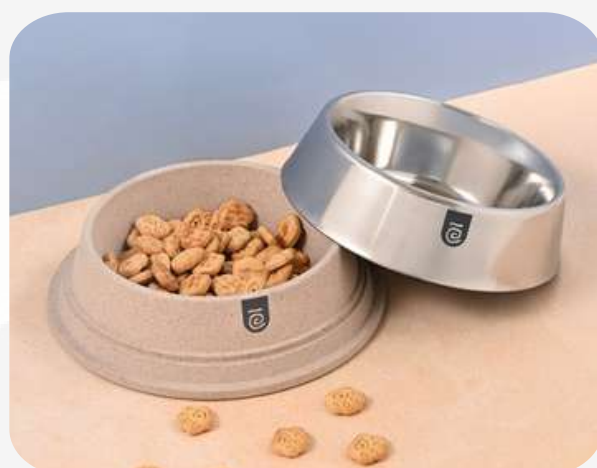
Duo bowl - 2 in 1