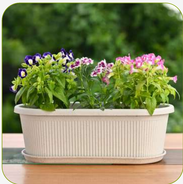
Regalia pot with tray