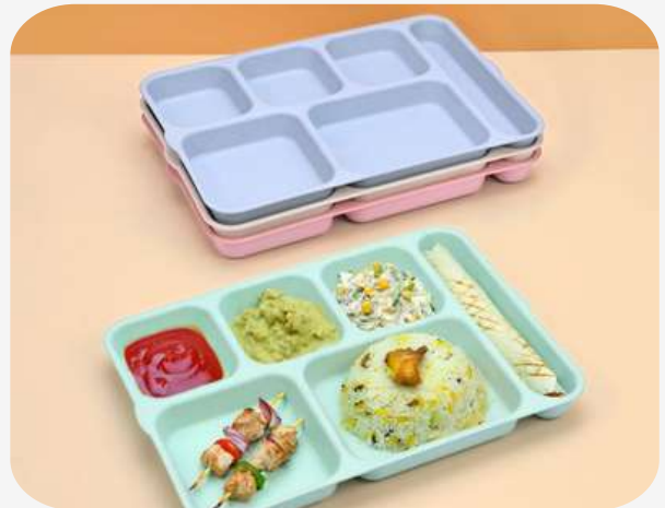
6 partition plate