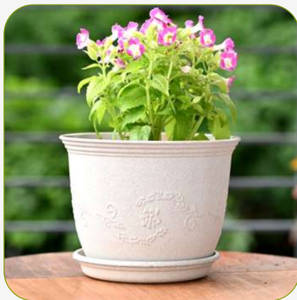
Leafy pot with tray

Colors: tortilla, charcoal & sand castle