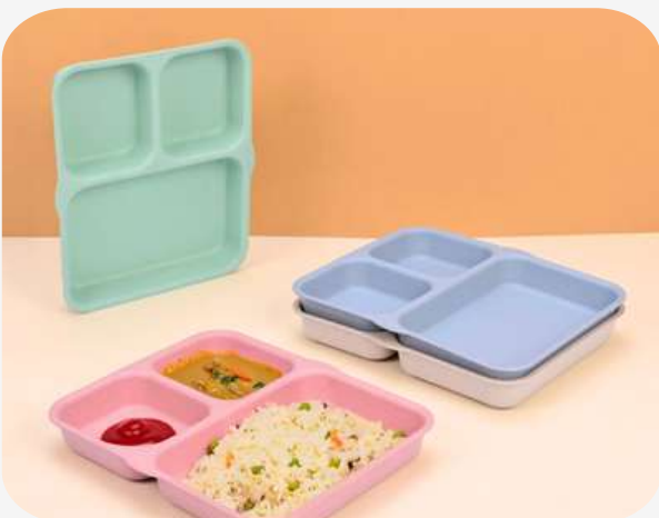
3 partition plate