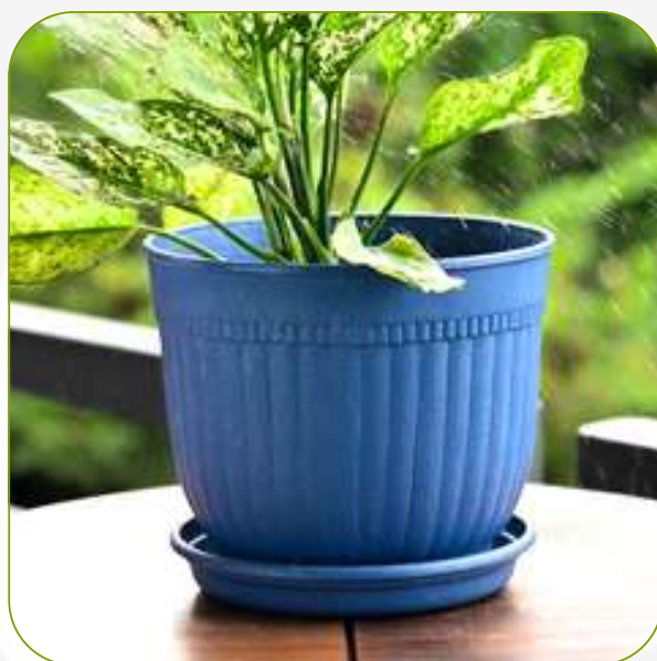
Petal pot with tray