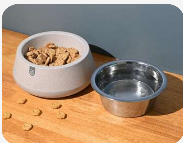
Ecosteel Bowl - 2 in 1