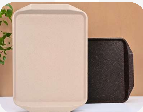
Cafeteria serving tray