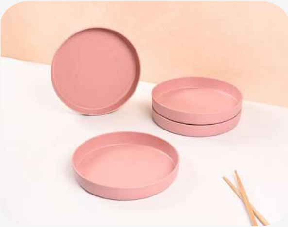
Round snack plate